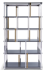
ART DECO RD15868